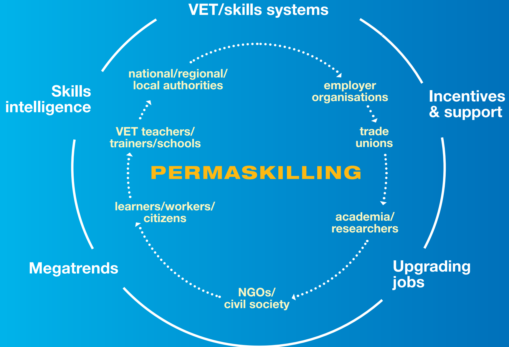
Figure 1. Elements of and actors involved in the permaskilling approach to VET and skills policy implementation