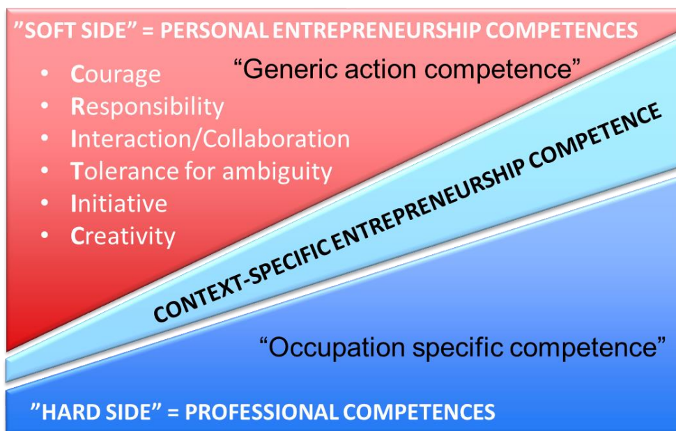
Figure 1. Complementary relationship between hard subject competence and soft entrepreneurship competence

The field research showed that these project courses played an important role in developing entrepreneurship competence among CVET learners. However, without the hard competence developed in the specific-role courses, learners would not be able to develop their entrepreneurship competence. Figure 1 shows how soft and hard competences complement each other. Without the soft competences (using an example of the six CRITICAL competences, Westerberg 2020), the occupation-specific competences would not be applicable and therefore not as valuable. Yet without the hard competences, the activity would not be meaningful. Learners require both types of competences and balancing the development of them is crucial for enabling learners to become actors 'capable of self-negotiated action' (Jones, 2019). CVET providers seem to have found a way to do this in cooperation with their partners and so have a system for developing both professional competences and the entrepreneurship competences needed to apply them in real-life situations.