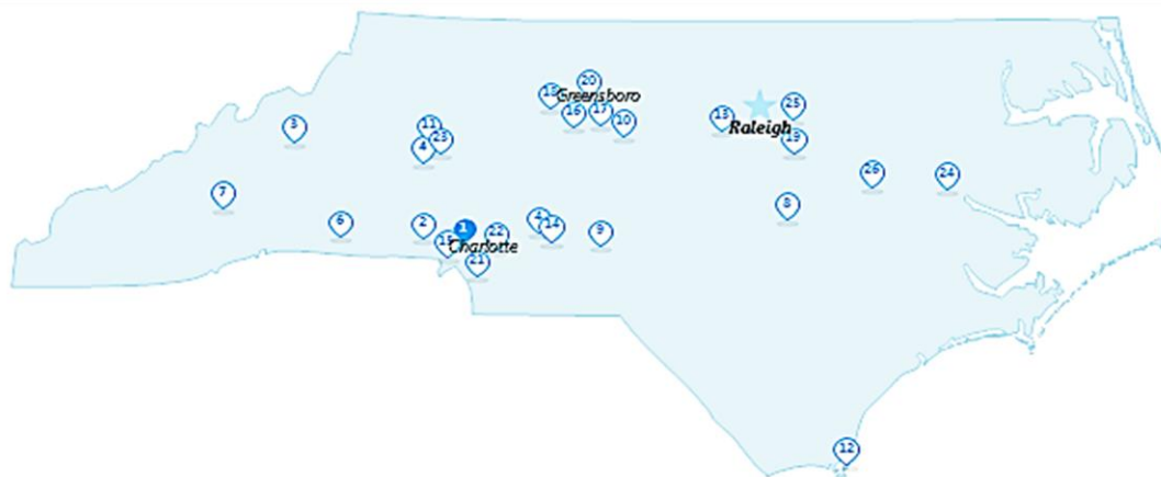
FIGURE 1 Map of Apprenticeship Consortia in North Carolina

Apprenticeship 2000 is widely considered the longest-running registered apprenticeship consortium for youth in North Carolina. 1 When it formed in 1995, the consortium model’s benefits were not entirely clear, and its popularity was not a given. Today more than 25 apprenticeship consortia operate across North Carolina (figure 1). The growth and rise in popularity of the consortia model owes much to Apprenticeship 2000 and its pioneering experimentation and success. Indeed, according to leaders from ApprenticeshipNC, 2 many of the programs operating today have been directly supported by Apprenticeship 2000 or influenced by its model. Apprenticeship 2000’s legacies are its lifespan (over 25 years) and its influence on the many new consortia that have followed in its footsteps.