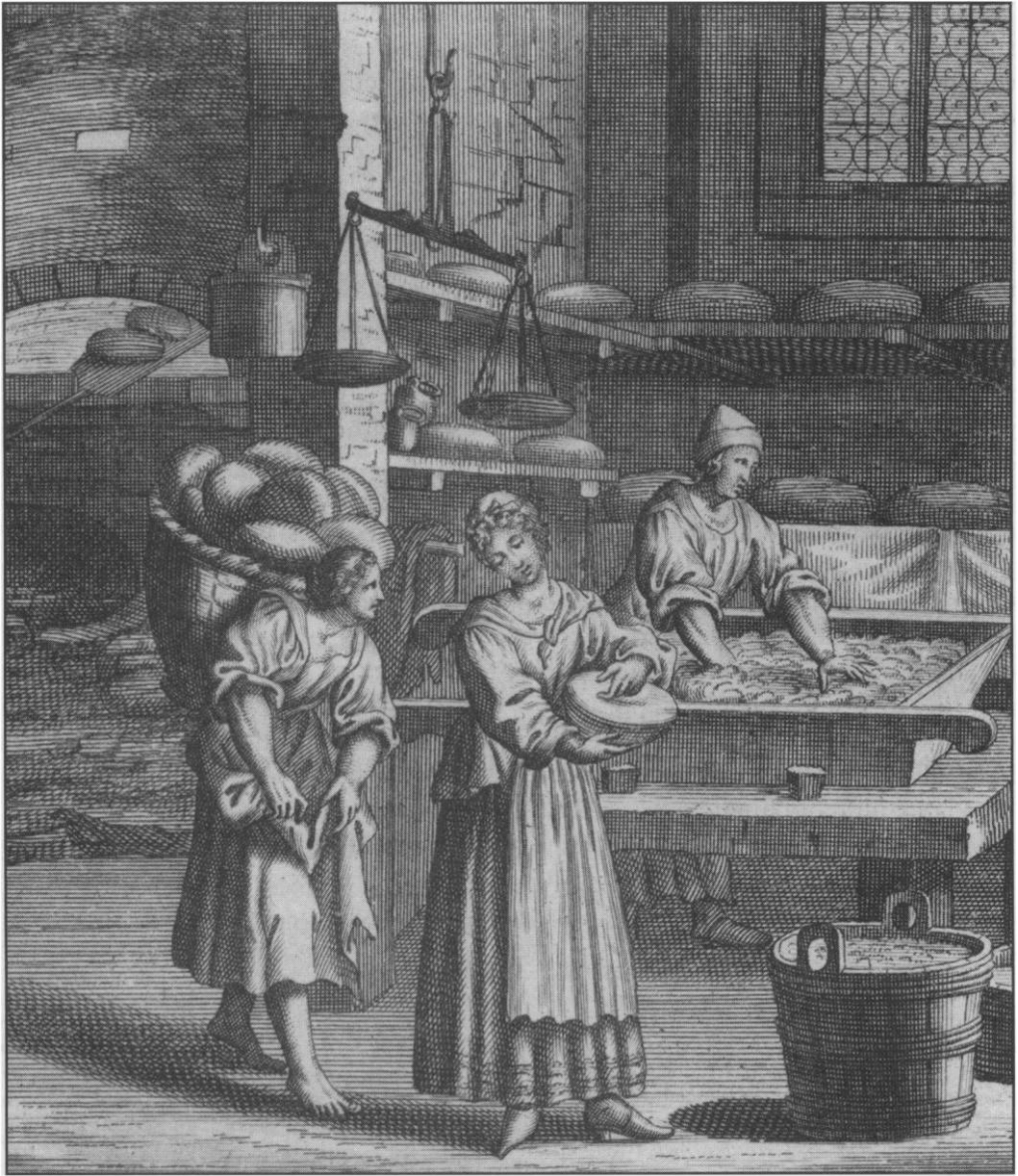
FIGURE 2: Master baker and wife do core guild tasks while unmarried female carries burdens. Florini, Æconomus prudens et legalis , 1191.

feature theorists view as helping to create social capital. Interacting in multiple spheres—economic, religious, social, political—ensures that members of a social network have multiple means of getting information about, punishing deviance in, and urging collective action on one another. 46 Guilds in Württemberg, as in other parts of early modern Europe, were indeed characterized by such multi-stranded internal ties. Members of the worsted weavers' guild in the Württemberg district of