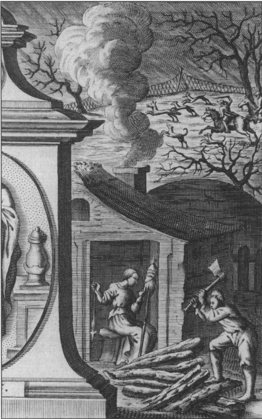
FIGURE 5: Woman spins while men chop wood and hunt. Florini, Æconomus prudens et legalis , 495.