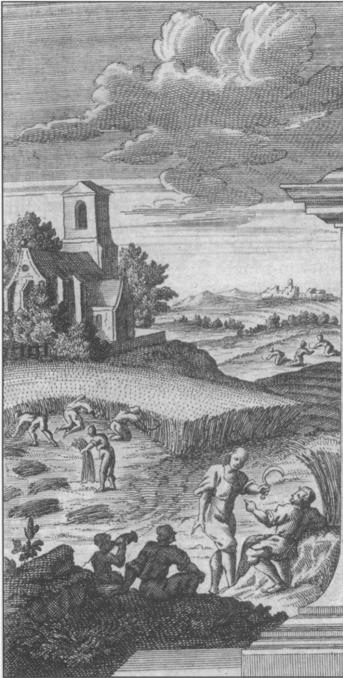
FIGURE 1: Women work alongside men as agricultural laborers mowing with sickles. Francisci Philippi Florini, Æconomus prudens et legalis, oder allgemeiner klug- und rechts-verständige Haus-Vatter (Frankfurt and Leipzig, 1702), 515.