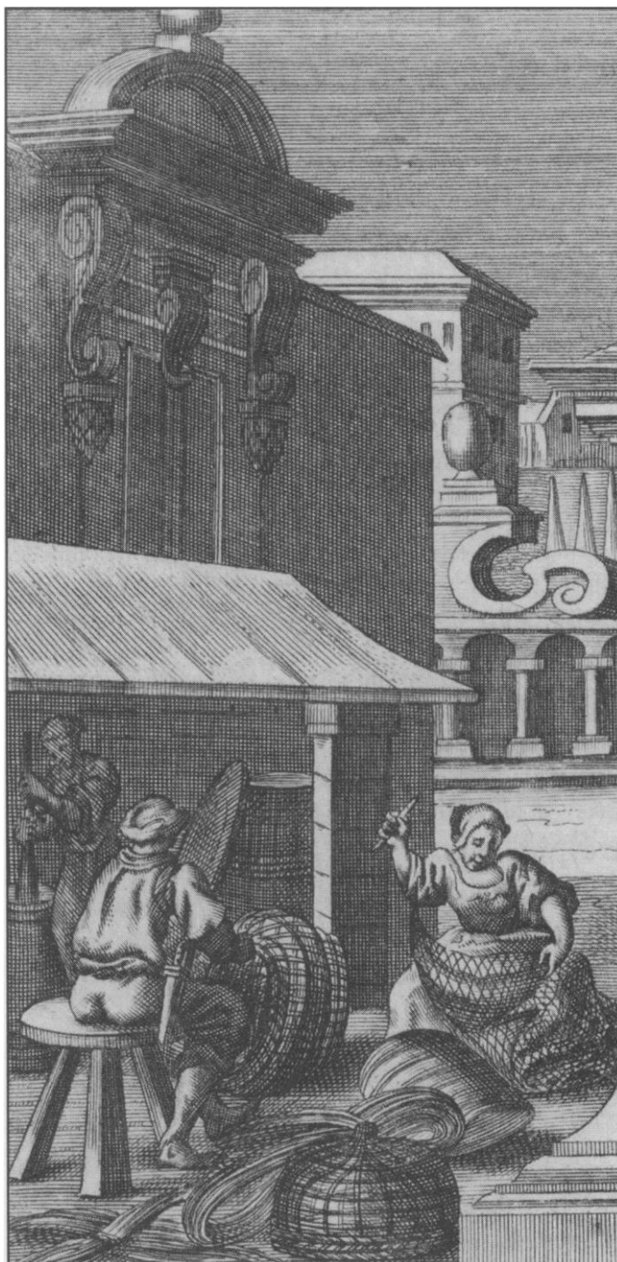
FIGURE 3: Married woman engages in guilded basketmaking alongside husband while unmarried female does housework. Florini, Economus prudens et legalis , 528.