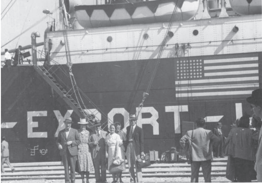
Figure 6: Group of ILO staff in Lisbon, waiting to board a ship to Canada, 1940.

ity had to be laid off. All in all, about 40 members of the ILO's staff travelled secretly through French and Spanish territories to Lisbon. From the Portuguese capital – where thousands of people fleeing persecution and war were desperately waiting for passage to a safe haven overseas – the group eventually boarded the steam liner Excambion , leaving Europe for an uncertain future.