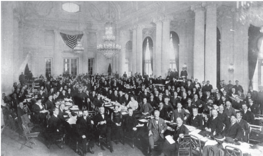
Figure 1: First International Labour Conference, Washington, D.C., United States, 1919.

October 1919, the conveners quickly realized that they could hardly have found a less welcoming environment for the Organization's constituting Conference. After his return from Paris, President Wilson had suffered a severe stroke, which further diminished his ability to influence the discussion. Only days before the meeting, the budget for the Conference was still not secure. Provisional offices could be found only after an intervention by the then Assistant Secretary of the Navy, Franklin Delano Roosevelt. In Congress, arriving European delegates were denounced as trouble-rousers, and when it was eventually decided to let the ILC take place, it did so only under the explicit condition that no US commitments as to future membership would be made. 74