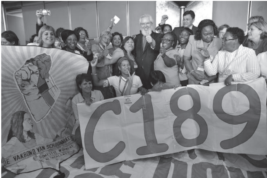
Figure 16: Representatives of domestic worker organizations celebrating the adoption of the Domestic Worker Convention (No. 189) with ILO Director-General Juan Somavía at the 2011 ILC.

ILO's long history of engagement with informality, which started in the 1970s with the World Employment Programme. 711