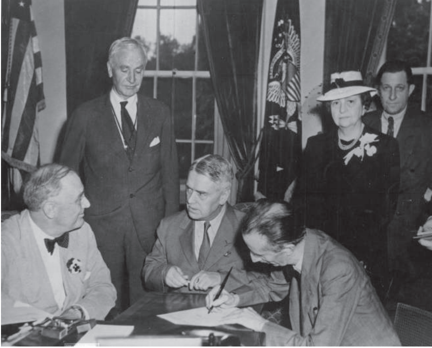
Figure 5: ILO Director-General Edward Phelan signing the Declaration of Philadelphia with Franklin D. Roosevelt, President of the United States, at the White House, 1944.

form upon which the ILO could secure its place in the post-war order, as the result of factors that its leadership and its most devoted supporters could only partly control.