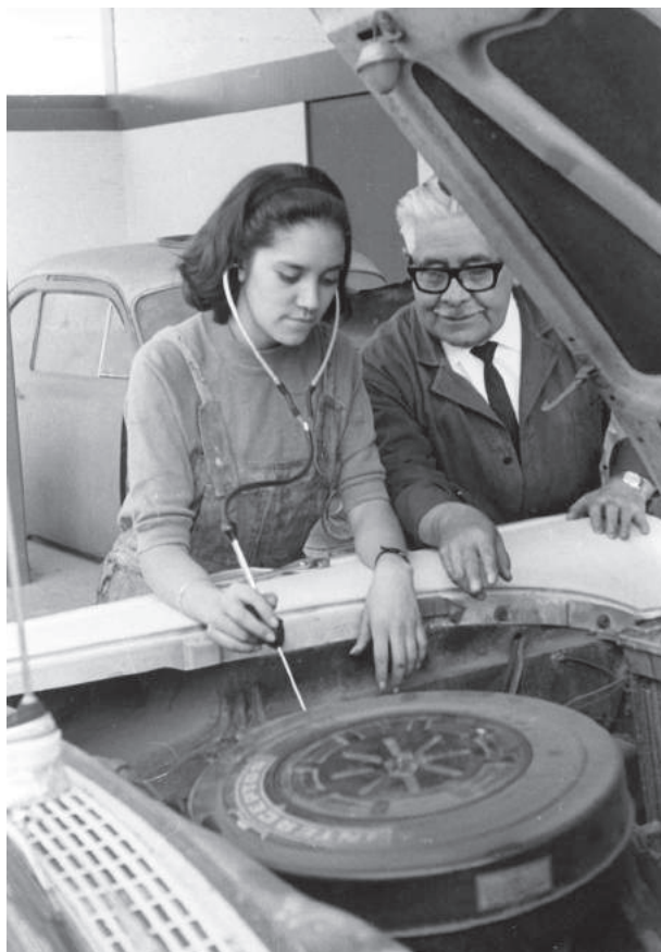
Figure 9: Training course in car mechanics, International Training Centre of the ILO, Turin, 1960s.

ception that “more scientific” approaches were necessary to gain credibility, both with the public and vis-à-vis other organizations carrying out similar functions. 433