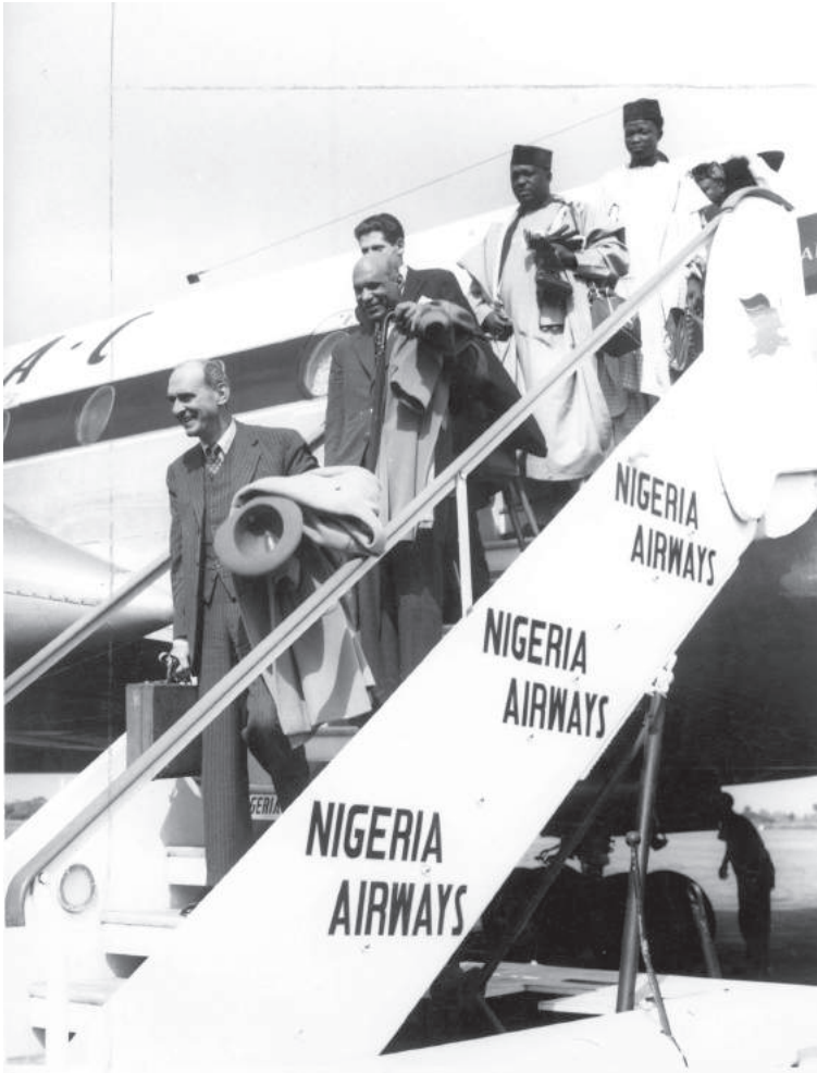
Figure 11: ILO Director-General David Morse arriving to the First African Regional Conference, Lagos, Nigeria, 1960.

international agencies to both launch large size programmes and get involved more directly in the developing countries' planning processes. Campaign-style programmes were also in line with new techniques tested by international agencies to reach out to a broader international public through cooperation with NGOs and academic partners. The WEP has to be seen in the context of a whole series of similar campaigns taking off from within the United Nations system during the 1960s and 1970s. Examples are the FAO's Freedom from Hunger Campaign