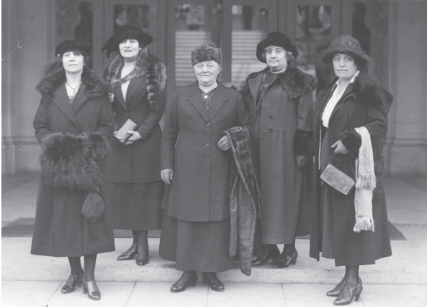
Figure 2: The Norwegian government delegate Betzy Kjelsberg (centre) with technical advisers. Kjelsberg was the first and only woman delegate with voting rights when she attended the third Session of the ILC in 1921.

The two Conventions that dealt specifically with women`s employment were, for most part, an expression of the protective mainstream thinking. For legal equality feminists the Night Work (Women) Convention (No. 4) was the quintessential expression of the attempt to perpetuate a social order through ILO standard-setting which gave men priority in access to jobs and relegated women to the role of housewife and mother. 152 By contrast, the Maternity Protection Convention (No. 3) had wider support among women`s organizations, because it also contained provisions for compulsory benefits that went beyond the merely protective frame. The protection of women workers during pregnancy and after childbirth has been the least controversial area of protective standard-setting for women, and it has