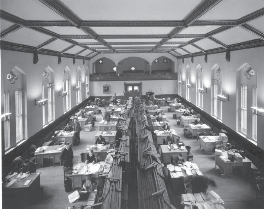
Figure 7: Morrice Hall, McGill University, Montreal, Canada, 1941.

Winant's strategy to move the ILO closer to the Americas now paid off, helping to pave the way for the Organization's survival. From its base in Montreal, the ILO was quickly able to retake the initiative. Because of his excellent contacts with the Roosevelt administration, Winant himself played a decisive role, and this allowed the ILO to reinvent itself. Winant made sure that the technical assistance missions to Latin America continued uninterrupted despite the Organization's limited budget. 298 This capacity to act, coupled with Winant's conviction of the ILO's potential role as a "spearhead of social and economic freedom" in dark times and an instrument to internationalize New Deal-style politics, significantly contributed to its survival. 299 They also outweighed flaws of Winant's leadership style, which was described by many as distant and erratic, sometimes bordering on a refusal to communicate even with his closest associates. 300