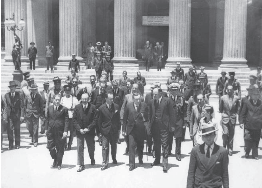
Figure 4: Chilean President Arturo Alessandri Palma and ILO Director Harold Butler (centre) leaving the inaugural session of the First American Regional Conference, Santiago de Chile, 1936.