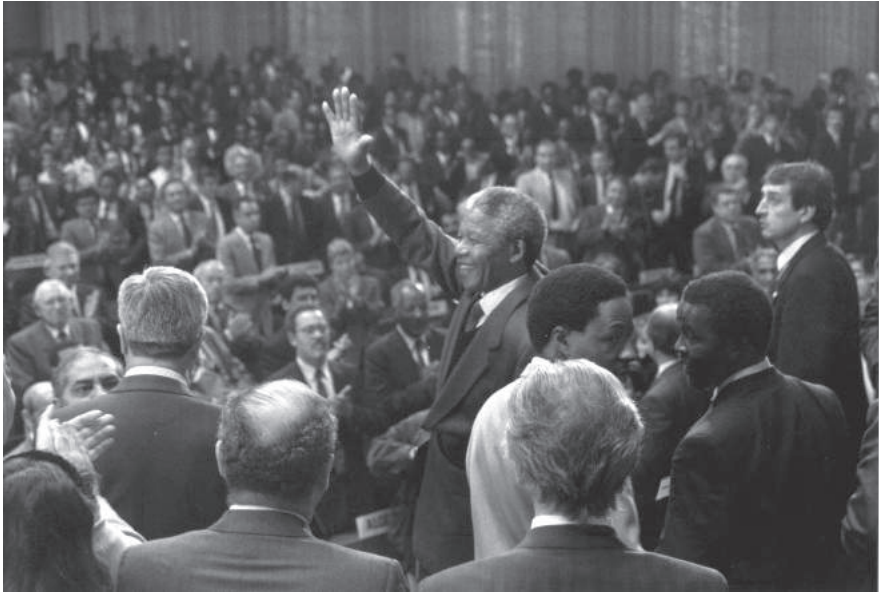
Figure 14: Nelson Mandela at the 77th Session of the ILC, 1990.

While unleashing an ever-increasing flow of goods and capital on an unprecedented scale and opening opportunities for businesses to expand, globalization has, at the same time, restricted the capacity of countries to control the economic forces working within their own national borders. As a consequence, governments – some more voluntarily than others – have abdicated some of their means to pursue social and employment goals, under the impression of presumably irrefutable demands of globalization. For the ILO, these developments and the debates accompanying them, spelled immediate dangers. Already during the late 1970s and 1980s some of the certainties – and indeed the foundations and premises on which the ILO’s work had rested ever since the Second World War – began to erode. If national governments and national trade union federations were losing part of their capacity to steer economic and social policies on the state level, the ILO would necessarily lose part of its influence, too.