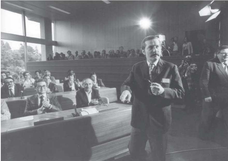
Figure 13: Lech Wałęsa at the 67th Session of the ILC, 1981.

(which, in return, received the backing for another resolution denouncing Israel). In March 1983, however, the Governing Body decided to establish a Commission of Inquiry, which found that there was no legal basis for the ban of Solidarnosc . The Polish government, supported by other socialist countries reacted with great indignation to the Commission's report which was submitted to the Governing Body in June 1984. In November of the same year, Poland submitted a notice announcing its intention to withdraw from the ILO within the regular two-year period. At this point, and despite continuing protests from the Workers' group, the ILO softened its approach towards Poland in order to keep the door for membership open. Martial law restrictions were progressively relaxed, and Solidarnosc could legally function again in 1986. Poland postponed its withdrawal and then actually never left. 614 By that time, the pace for changes in the region was set by the policy of perestroika under the new Soviet leader Mikhail Gorbachev. As one of the consequences of this change, the Workers' representatives of the formerly monolithic communist bloc were no longer obliged to vote in accordance with