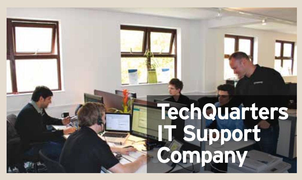
Apprenticeships are providing TechQuarters with highly skilled industrious IT engineers.