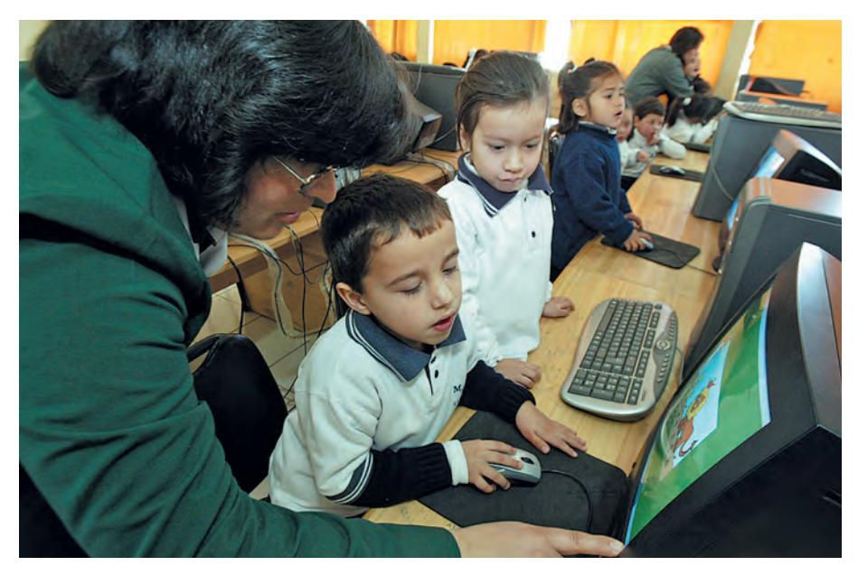
Teachers with ICT skills are crucial in preparing children for the future (Chile)

concept of teacher education; one that stood in open contradiction with the modern professional concepts of the time.<sup>216</sup> The incongruence of this measure and the protests of those concerned made the military authorities retract and in 1987 they reconverted two of the Higher Academies that had belonged to the University of Chile into pedagogical universities. Some years later, with the enactment of the Organic Law of Education (1990), teacher education regained its status as a university career. Currently, universities offer programmes leading to a Licentiate degree as well as a teaching qualification. A small number of professional institutes are allowed to prepare teachers and grant a professional qualification, but not a degree.<sup>217</sup>