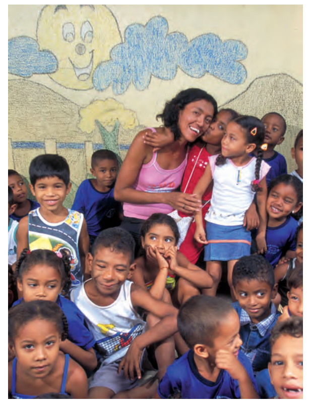
Teachers who love and respect their students make children happy and motivated (Brazil)

Other reasons mentioned by stakeholders for the current absence of a national CP in Brazil include: