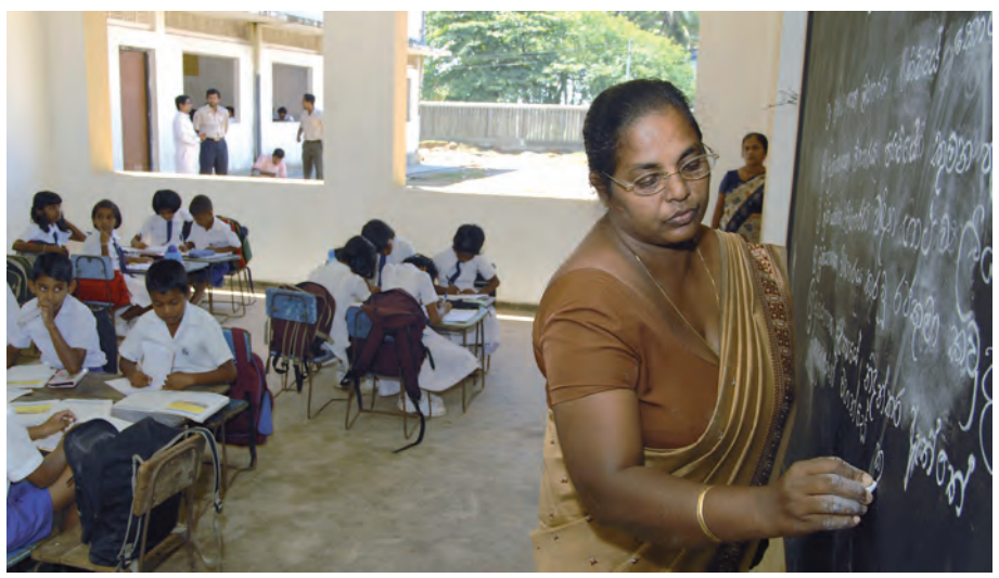
Effective teachers love their job and working with children (India)

For example, the 15 assessment criteria of a teacher training institution in the South District of Delhi are: