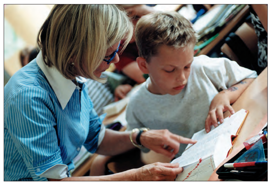
For qualified teachers the child is central in the education process (The Netherlands).

The first phase ended in April 2002, when the first version of the proposal for competence requirements was handed to the Minister of Education at the time. This version was published on the SBL-website and widely spread amongst the professional group of teachers in the form of a CD-rom and a video documentary. The video film was shown to groups of teachers, who then exchanged ideas, at hundreds of meetings (workshops, conferences, seminars). At SBL's request 15,000 copies of the CD-rom were distributed.<sup>251</sup> An SBL stakeholder states during an interview that although CD-roms were distributed throughout the country, not all teachers have received one. "That was a logistical problem," she says. "But I believe that everybody has also his/her own responsibility to get to know the law."