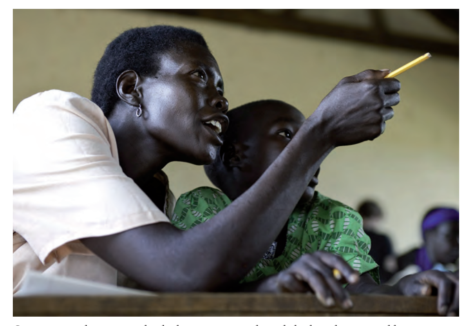
Competent teachers give individual attention to students, help them discover and learn (Uganda)

Basic Minimum Requirement Standards (BRMS); school mentoring programmes; the Quality Enhancement Initiative; an induction curriculum for new teachers; Customized Performance Targets for the head teachers and their deputies; a new teacher training curriculum at primary level; a revised Scheme of Service; and a new thematic curriculum, focusing on learning in children's mother tongues rather than English.