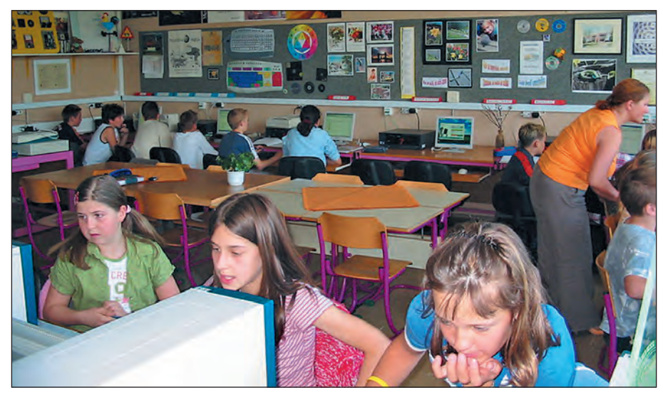
Teacher competence: make individual teaching possible in a group dynamic (Slovenia).

constitution, European legal system and national and international acts on human and child rights.<sup>269</sup>