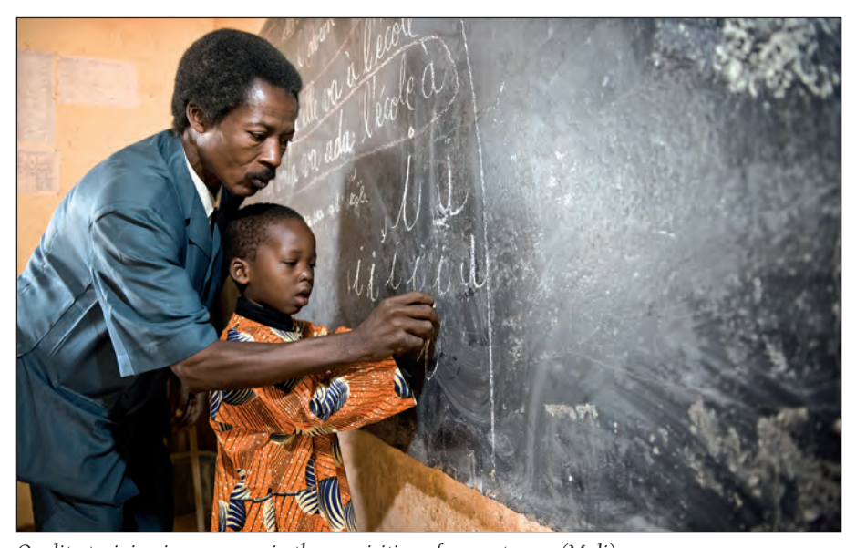
Quality training is necessary in the acquisition of competences (Mali)

Both the feasibility study commissioned by the Quality Educators for all Project (June-July 2008) and the report "Profile of Quality Teacher in Mali" (August 2010) indicate that although the analysis study on needs in December 1999 had been intended to be based on a broad consultation and consensus, CSOs, parents and students had not been involved. Furthermore no validation and dissemination policy had been developed. As a result the competence profile remained unknown by most of the actors in the field and thus unused.