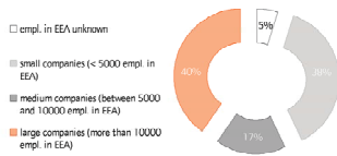
Data source: European Trade union Institute, EWC database, July 2009