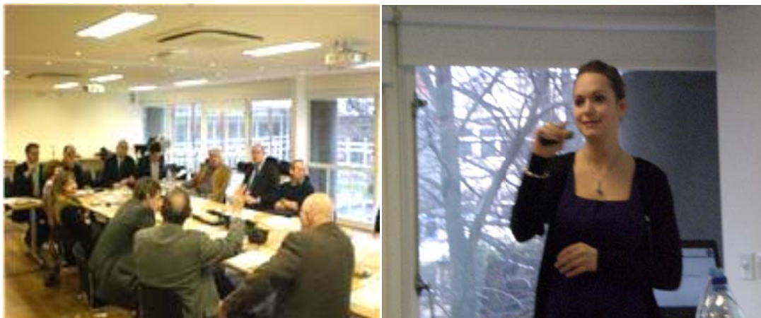
(Participants in the seminar)