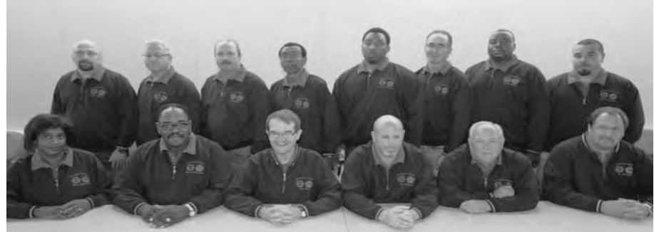
The 2011 UAW Chrysler National Negotiating Committee