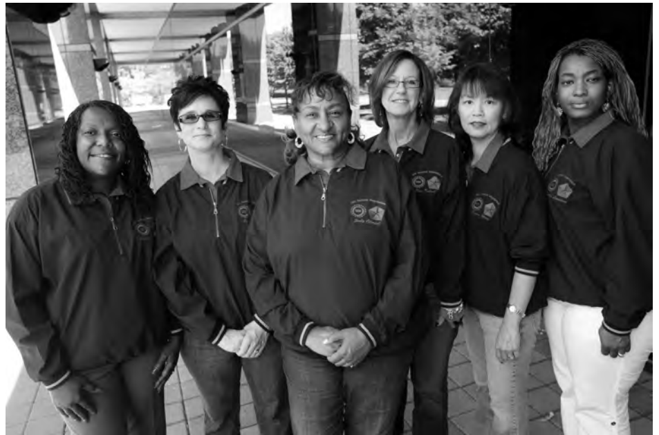
UAW Chrysler Department clerical support, all members of OPEIU494.

Dues are determined by UAW Constitutional action and are not a subject of negotiations. Dues are based on the principle that they reflect each worker's cash income, normally two hours' pay per month. Lump-sum cash payments are subject to dues because they too represent cash income, and are assessed at the traditional rate of 1.15 percent, which is equivalent to two hours' pay per month.