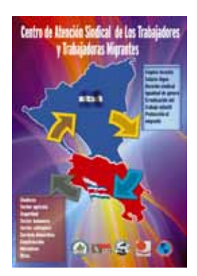
This leaflet introducing the Centro Sindical de Migrantes (CSM (Trade Union Centre for Migrants)) gives the centre's contact details and summarises the fundamental rights of migrant workers.