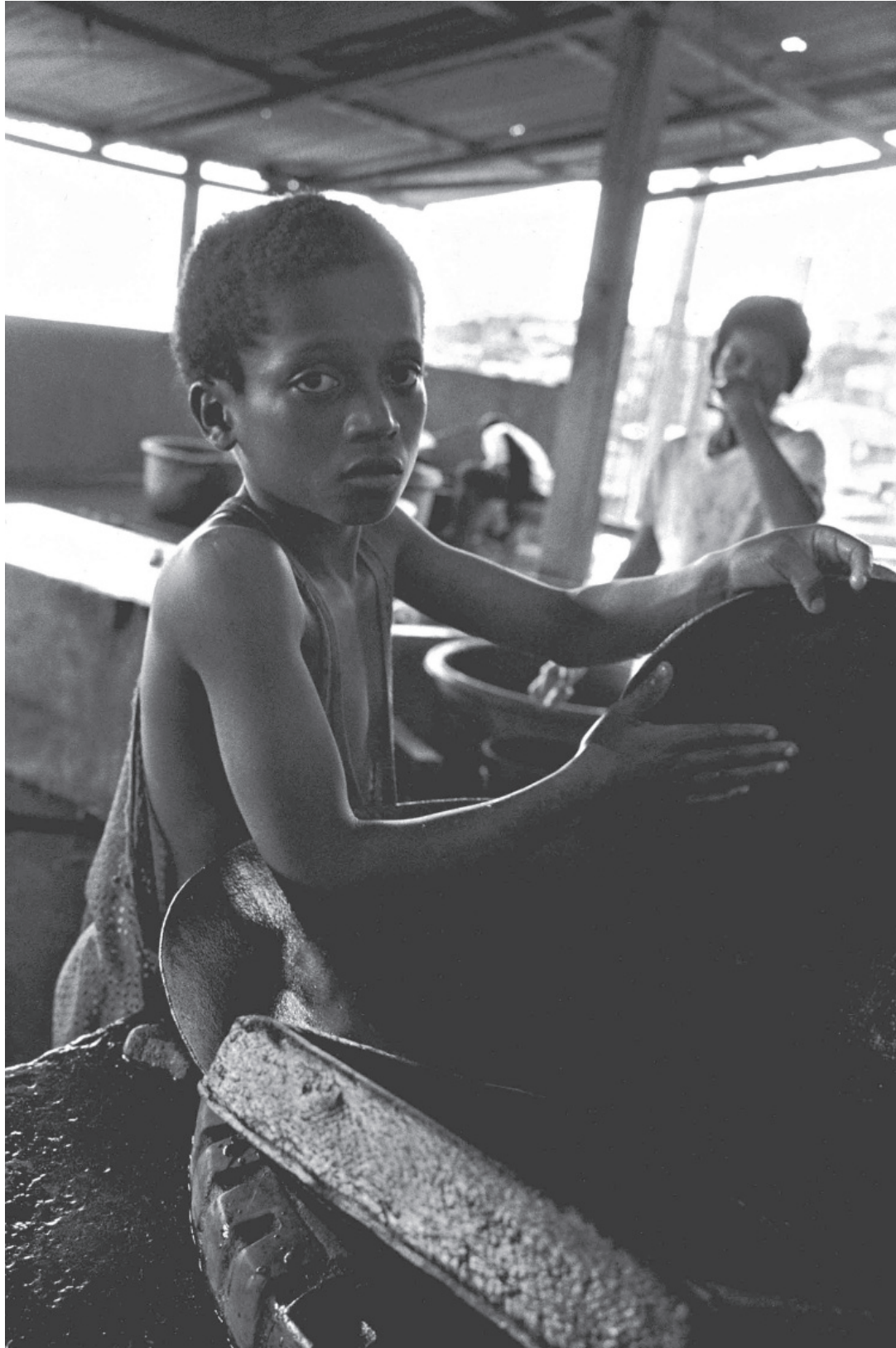
Child amalgamating gold ore