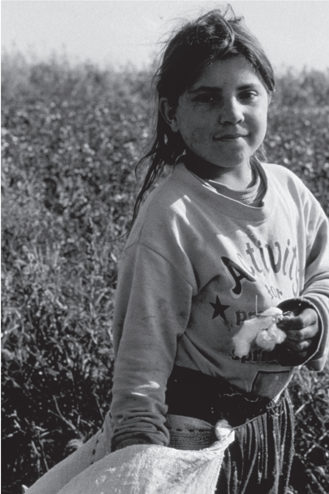
Migrant girl picking cotton