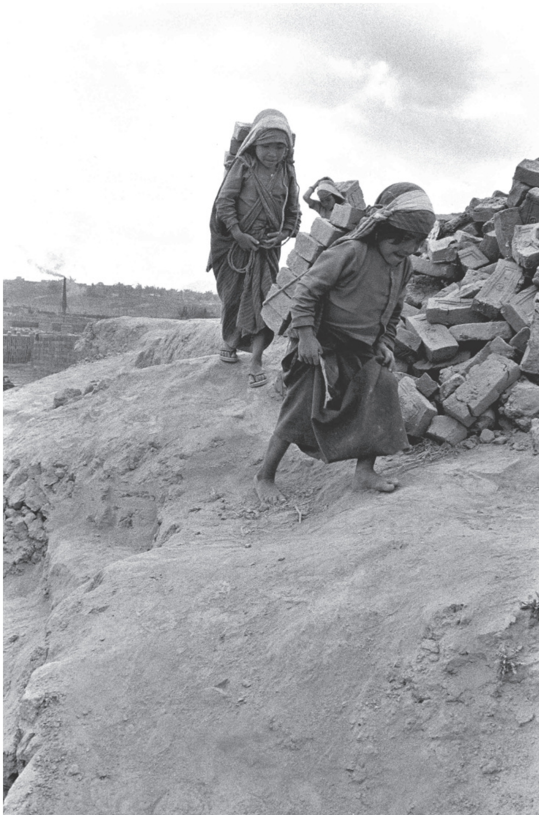
Children carrying bricks in a brick kiln