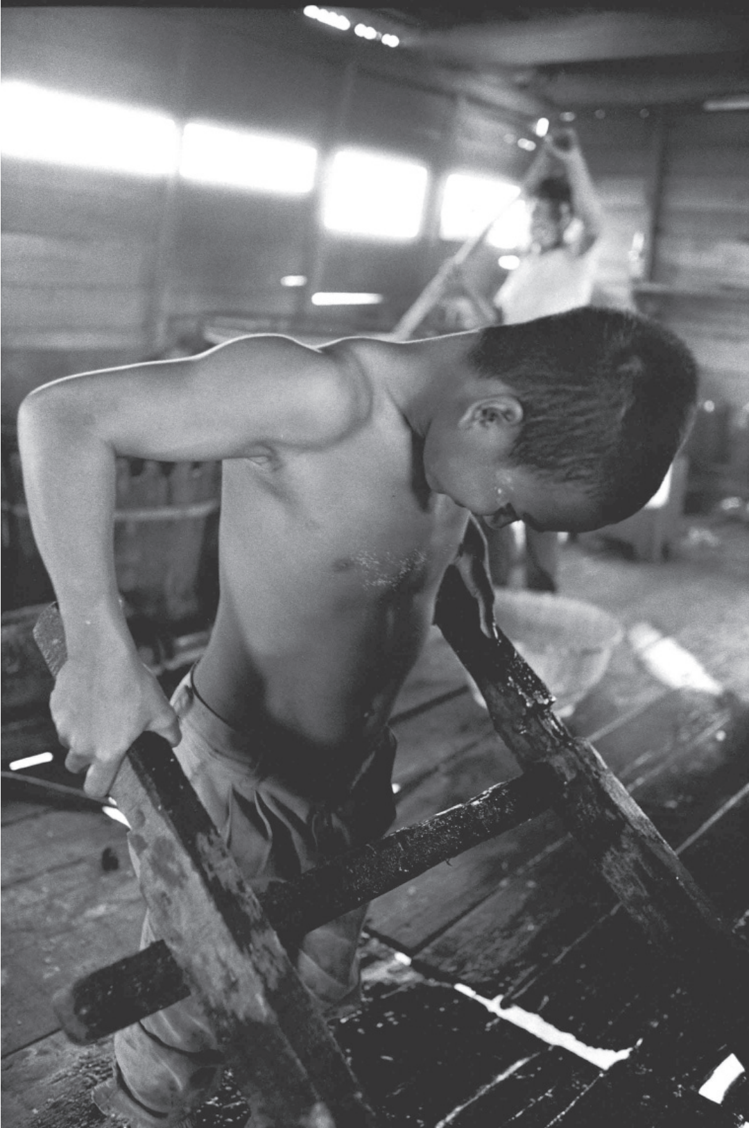
Child working on a fishing platform