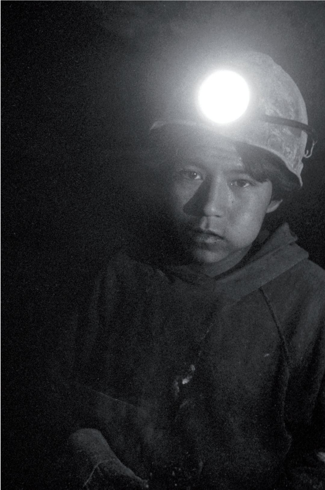
Child miner