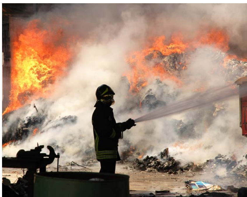
Ivan Castelli - EU-OSHA photo competition