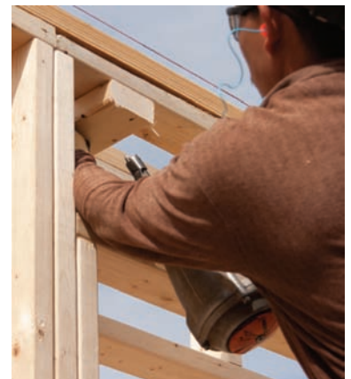
Nail penetration through the lumber is a special concern where the piece is held in place by hand