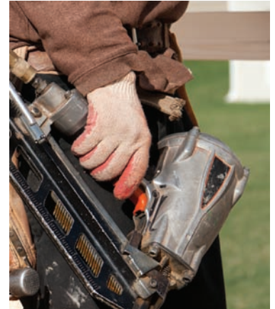
Common nail gun grip with finger on trigger

Bypassing or disabling certain features of either the trigger or safety contact tip is an important risk of injury. For example, removing the spring from the safety contact tip makes an unintended discharge even more likely. Modifying tools can lead to safety problems for anyone who uses the nail gun. Nail gun manufacturers strongly recommend against bypassing safety features, and voluntary standards prohibit modifications or tampering. 7 OSHA's Construction standard at 29 CFR 1926.300(a) requires that all hand and power tools and similar equipment, whether furnished by the employer or the employee shall be maintained in a safe condition.